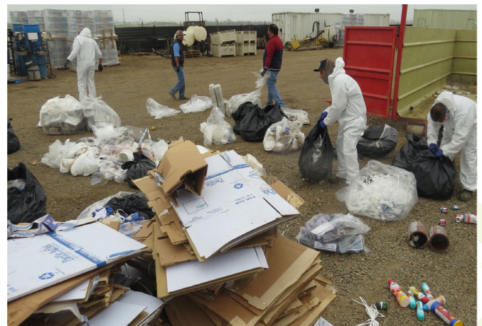
GoodFarms waste audit

Total reduction in greenhouse gas emissions (equivalent to 1,080,454+ miles driven by an average gasoline powered passenger vehicle)