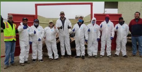
Andrew & Williamson Fresh Produce/GoodFarms Buenaventura Ranch , an open field strawberry farm, Santa Maria, California