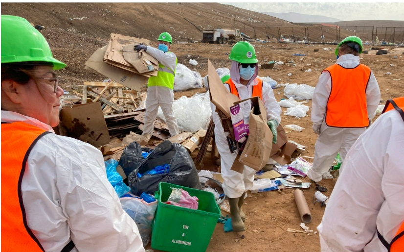
Misionero waste audit

EFI and MTI led the Green Team members at each pilot site through training sessions and hands-on activities to build their capacity to develop and implement a waste reduction plan. Teams were encouraged to identify waste-related problems or opportunities and design solutions to fit their organizations as they progressed through the training and activities.