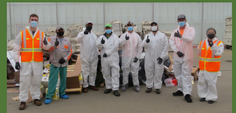
Windset Farms® tomatoes and cucumbers greenhouse operation, Santa Maria, California