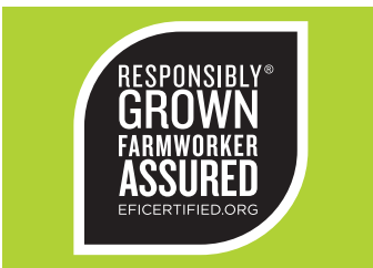
Black and White No Outline for use on a color background