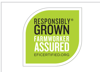
Full Color With Outline for use on white background