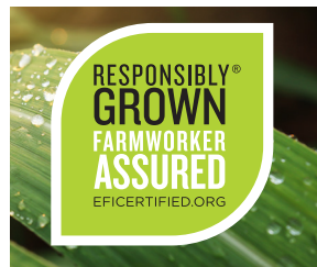
Full Color No Outline for use on a color or image background