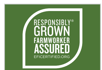
Single Color White for use on color or image background