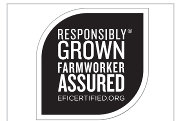
Black and White With Outline for use on white background