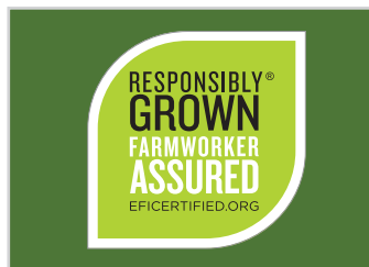
Full Color No Outline for use on a color or clear background