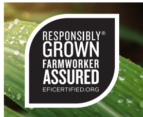
Black and White No Outline for use on an image background